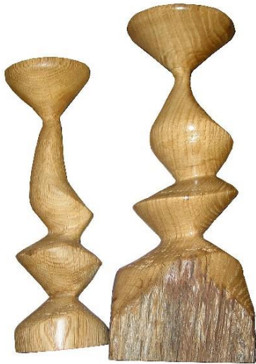
Two candle sticks using offset spindle