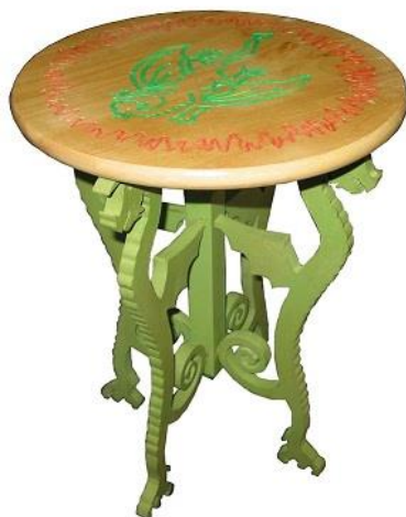
A side table in Beech and MDF