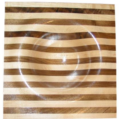
Striped bowl in Canadian maple and American black walnut