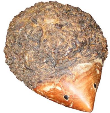
Hedgehog in apple