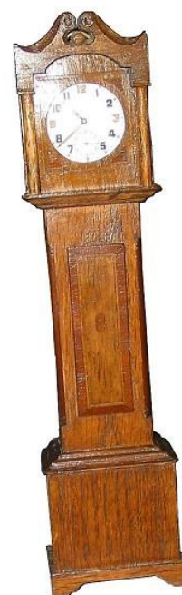
Watch holder in oak and mahogany