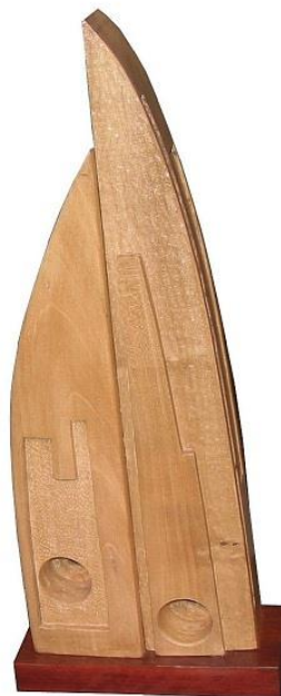
Back to Back in tulip and mahogany