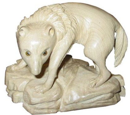
Arctic Wolf in holly