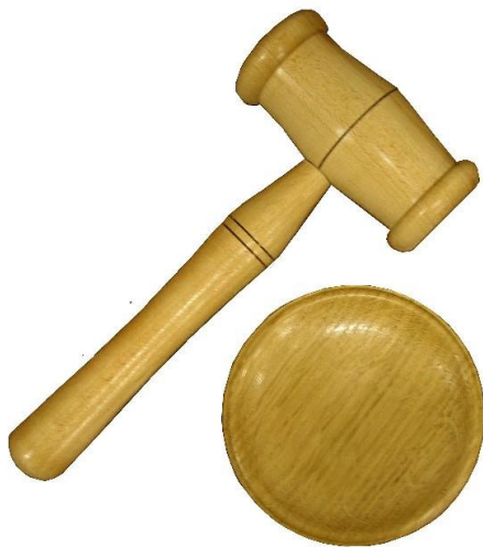
Gavel in beech on oak base

11th April (At Royal British Legion Hall)