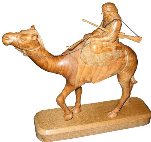
A camel and rider in oak