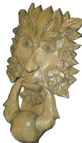
A green man in oak